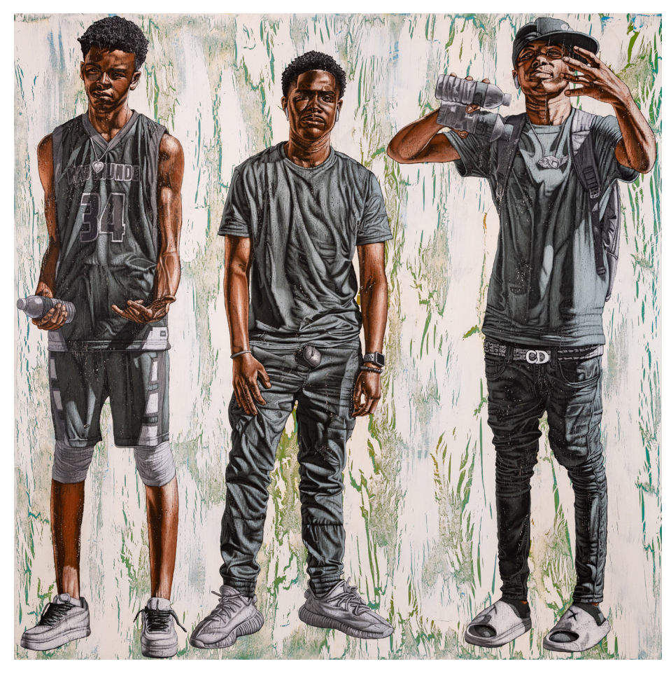
Alfred Conteh, Stanton Road Water Boys, 2022. Acrylic and urethane plastic on canvas, 84 x 84 in

Opening Reception: November 19, 2022, 4 - 7 pm