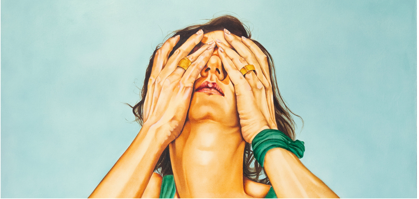
Alemeh Bagherian b.1984; I Will Never Reach You, 2021; Oil on canvas 47 1/2 x 39 1/2 in. (120.65 x 100.33 cm)