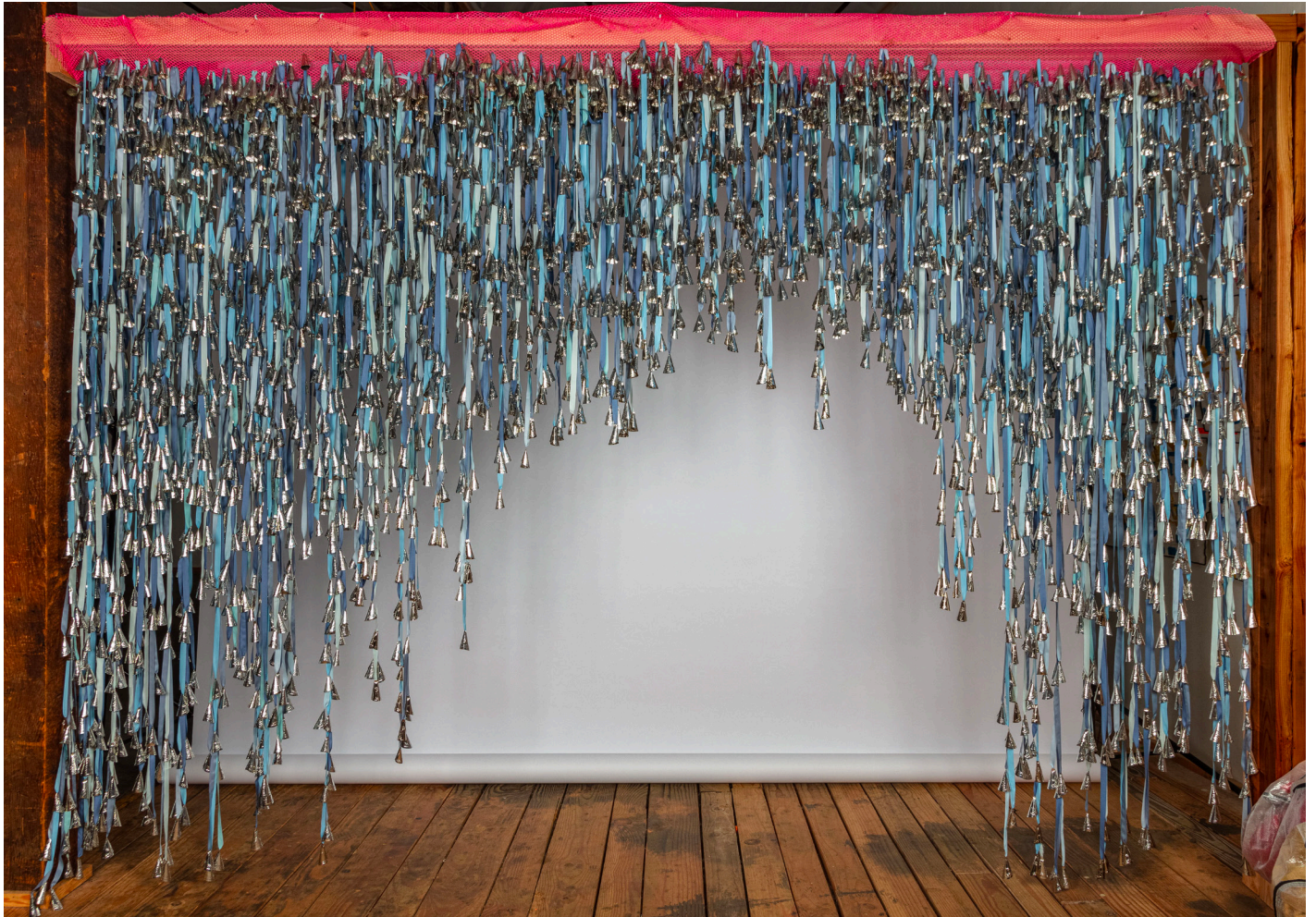
Marie Watt, Sky Dances Light: Threshold II , 2023, Tin jingles, cotton twill tape, polyester mesh and steel 106 x

Though their invention and use as fashion adornments dates at least to the late 1800s, tin jingles became an iconic element of Indigenous dance traditions during the Spanish Flu pandemic of 1918.