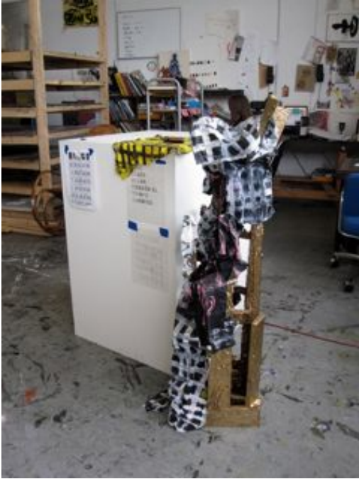
More photos of Otero's studio: