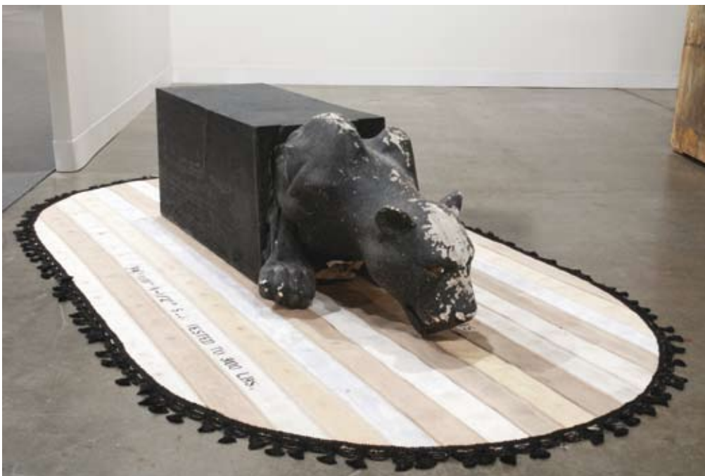
all images: courtesy the artist and Kavi Gupta, Chicago & Berlin