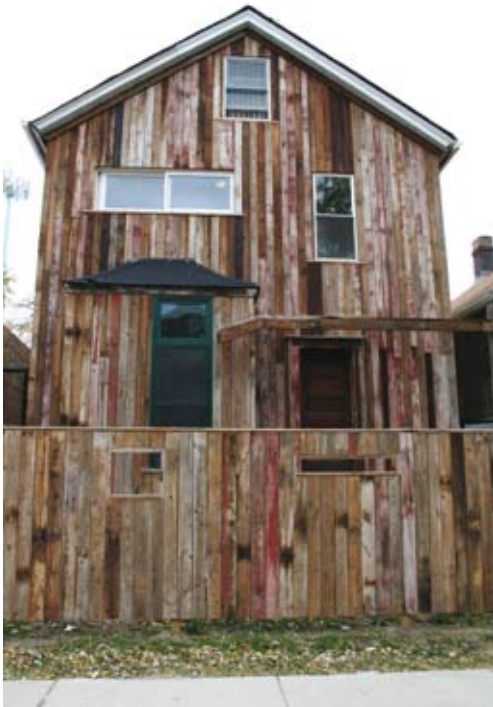
from top: The Dorchester Projects, 2006-, interior, Prairie Avenue Bookstore Archive; exterior.

WITH SOMETHING IT'S BEEN SO RELY LACKING: PURPOSE.